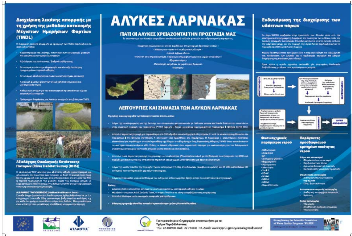
The pictures below illustrate the placed boards:

Two sign boards were prepared in October 2010 and were placed at the Larnaca Salt Lakes. The boards are made of metal and have a size of 120X80 cm. The boards inform the Salt Lake visitors about the project, its tasks as also about the methodology used.